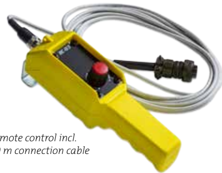
Remote control incl. 10 m connection cable

The XUPERmax 2 3000 is manufactured with a cooling tunnel. This prevents dirt from coming into contact with the electronic components. To minimize noise and to minimize dust accumulation in the unit, the fan runs only during the welding process.