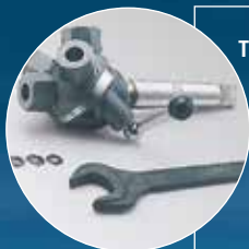
Tailstock turret heads for centering, drilling, counter-sinking and thread cutting