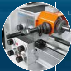
Lever-operated collet chuck for stationary collets