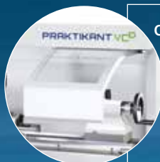
Chip and splash guard movable with inspection window