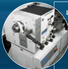
Lever-operated collet attachment for draw-in collets