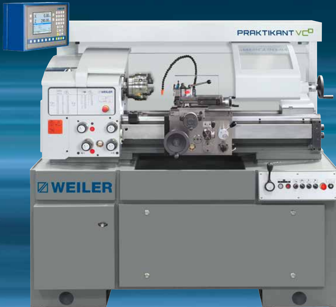
Photograph shows optional features