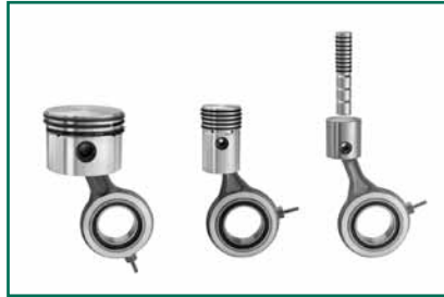
All pistons with steel piston rings