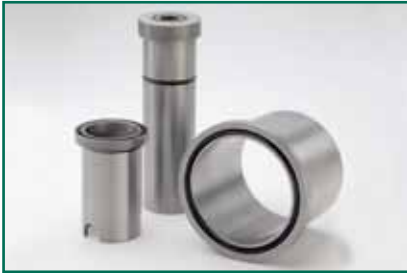
Hardened cylinder sleeves