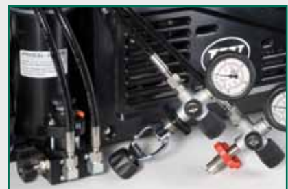
200/300 bar switch over device