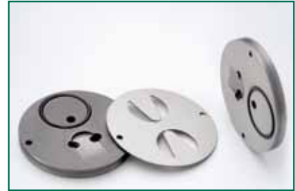
Precision machined suction/pressure valves