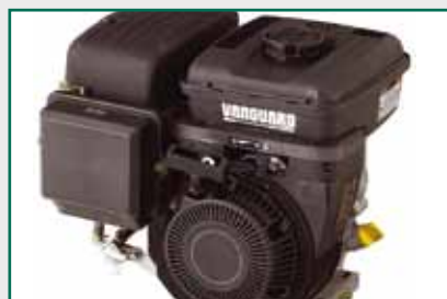
Conversion set petrol/electric drive