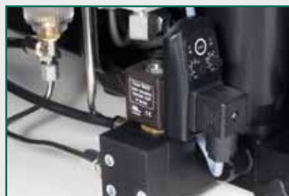
Automatic condensation drain