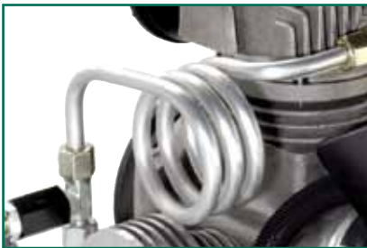
Efficient cooling for extended filter life