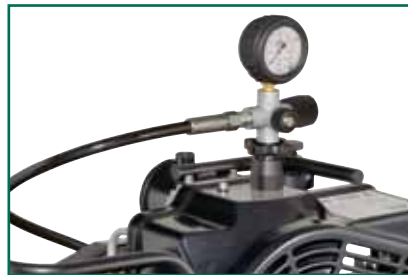
Integrated filling hose